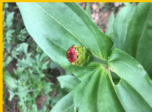
God is good.