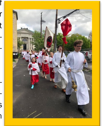
Calvary Choir, Palm Sunday Procession