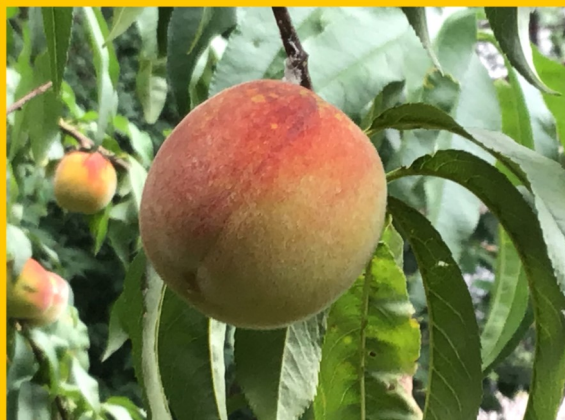
Peaches are almost ripe.

-Wendell Berry, 'Prayers and Sayings of the Mad Farmer'