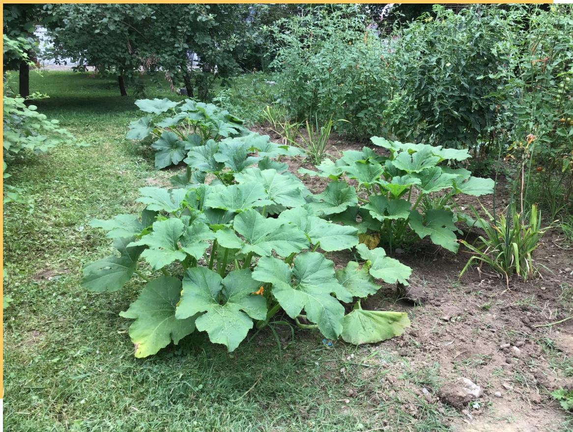
Squash plants with tomatoes and day lilies.

(The Garden of Goodness is Calvary's Community Garden; all photos are taken there .)