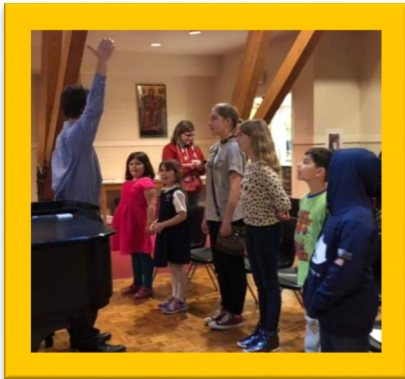
Calvary Children's Choir, in rehearsal