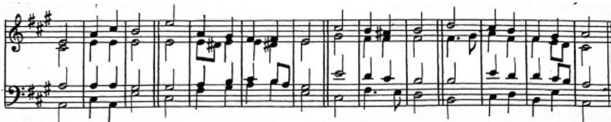
Setting 1: #107; setting 2: #108-109