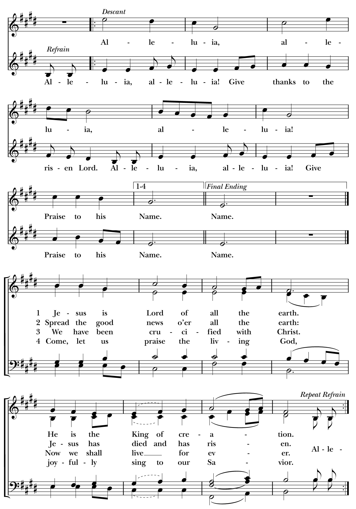
The descant may be sung after stanzas 3 and 4.