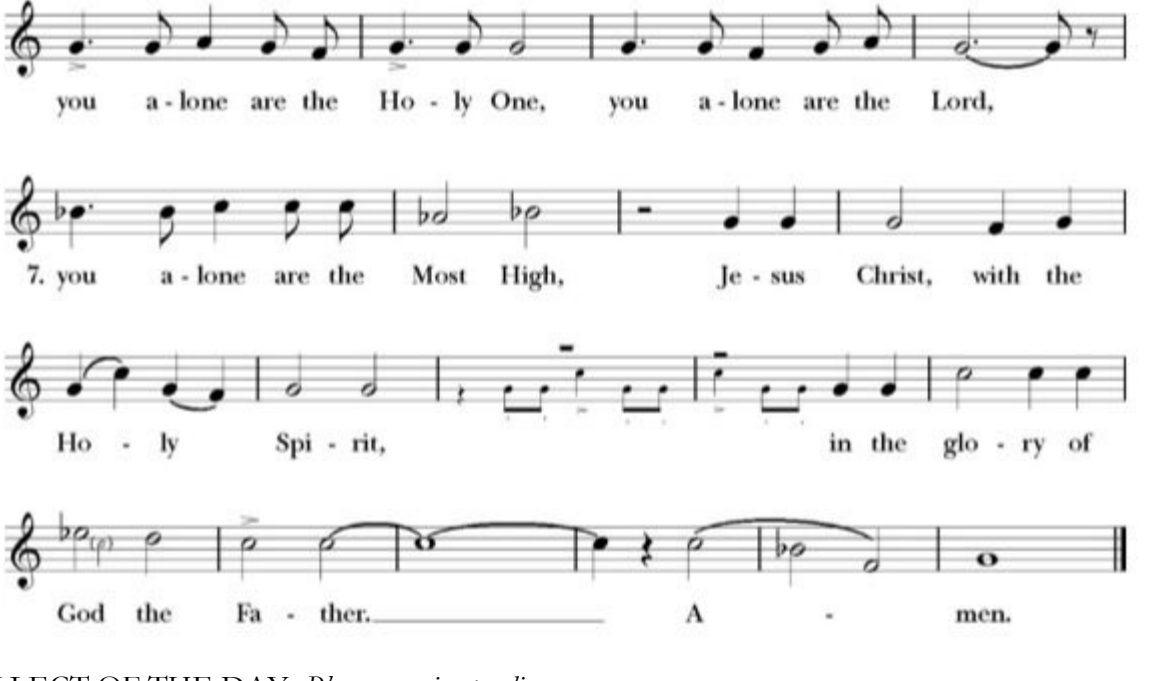
THE COLLECT OF THE DAY Please remain standing