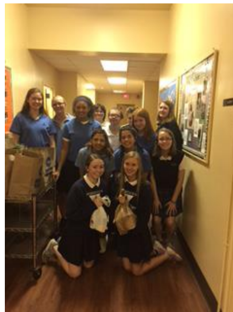
Food & Clothing Ministry